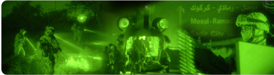
Above images were taken using genuine Star-Tron® Night Vision Products (MK-880 Camera Kit) and a Nikon D2 Digital SLR Camera.