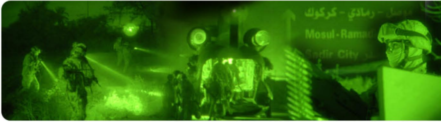
Above images were taken using genuine Star-Tron® Night Vision Products (MK-880 Camera Kit) and a Nikon D2 Digital SLR Camera.